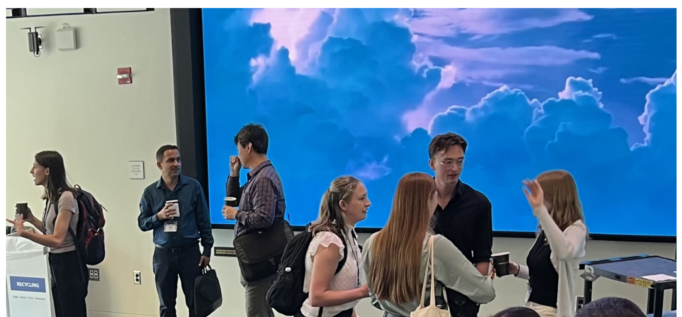
HAQAST held its first early career workshop ahead of the Massachusetts meeting.